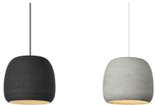
black / black small