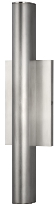
CHARA 17 WALL shown in satin nickel