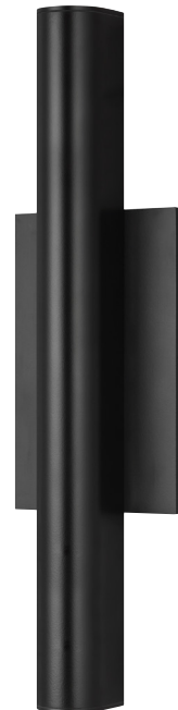
CHARA 17 WALL shown in black

* Visit techlighting.com for specific warranty limitations and details.